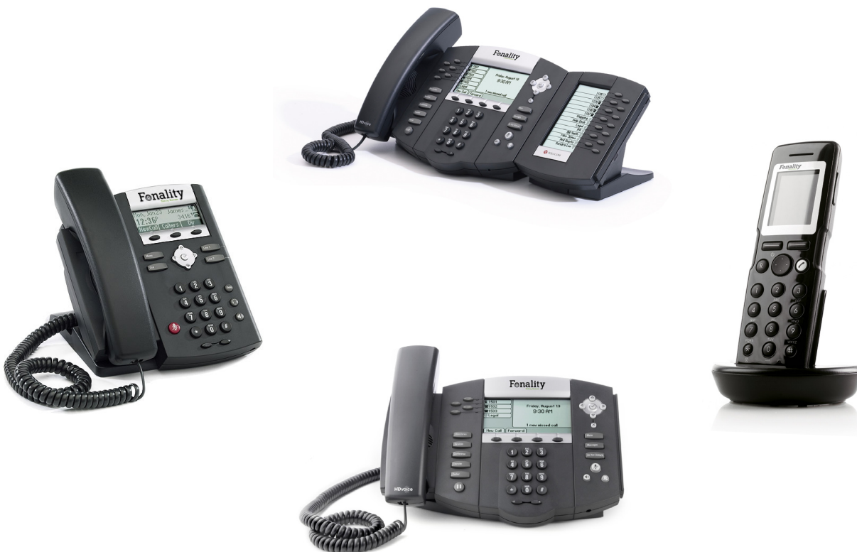
Available Phones: Polycom 331, 550, 560, 650, 6000, 5020, and Aastra 480i CT